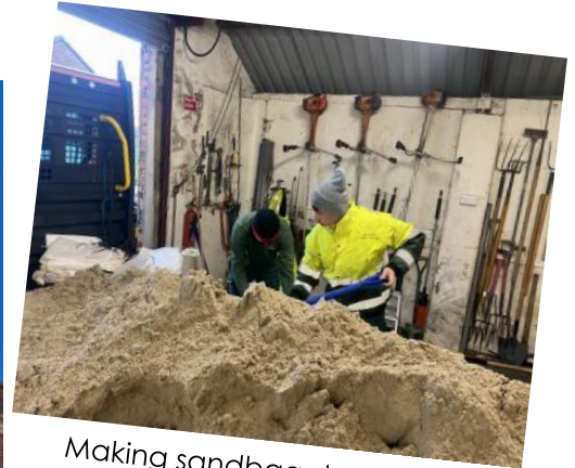
Making sandbags to protect residents from flooding