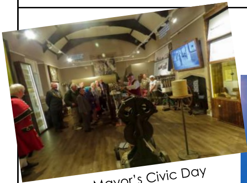
The Mayor's Civic Day