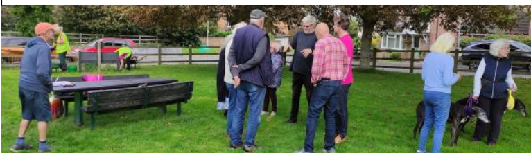
Two of our outdoor councillor recruitment events—both featuring residents who went on to be elected!