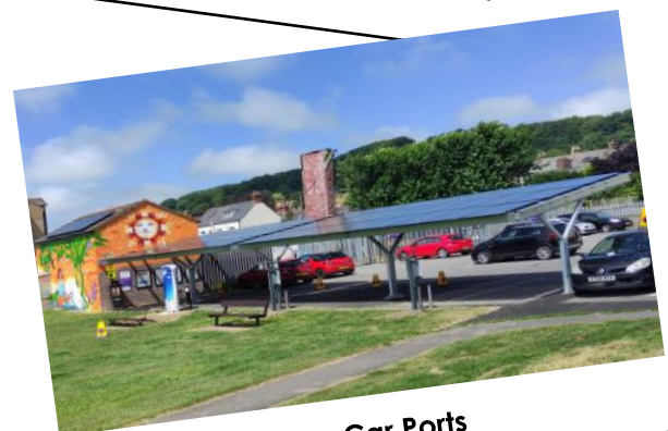
Solar Car Ports