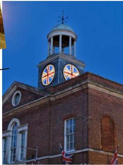
The Town Hall clock, decorated for the Coronation