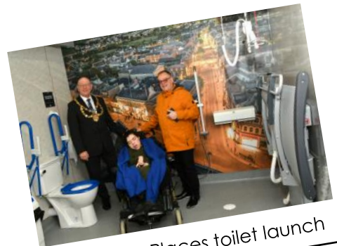
Changing Places toilet launch