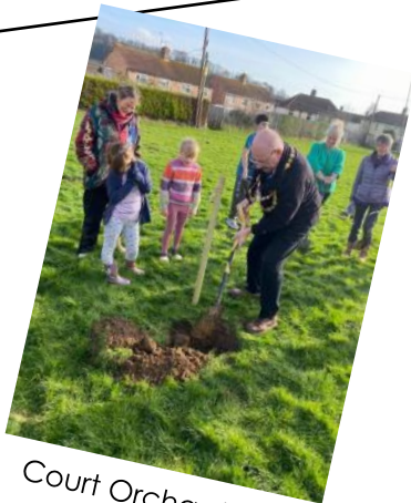
Court Orchard tree planting