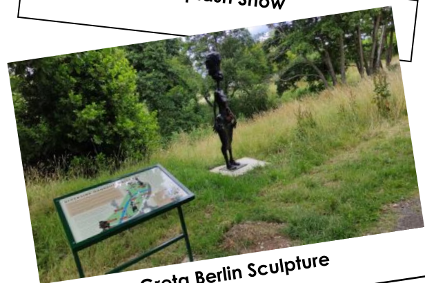
Greta Berlin Sculpture