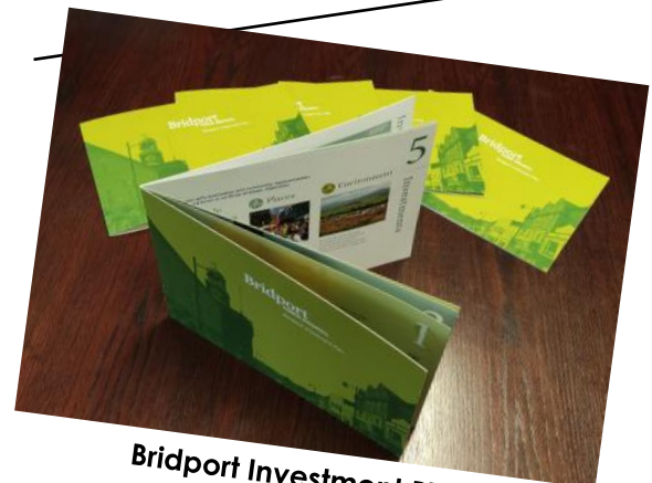
Bridport Investment Plan